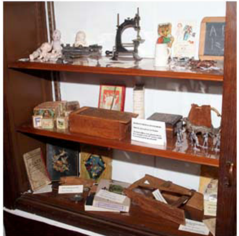
Also, Kewpie dolls, a locomotive, a miniature sewing machine, a slate, lead soldiers, books and a hand made sled.