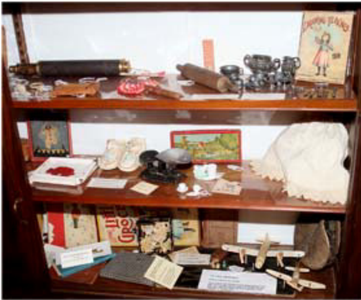
Enclosed glass cabinet displays a miniature telescope, tea set, games, books and handmade airplanes.