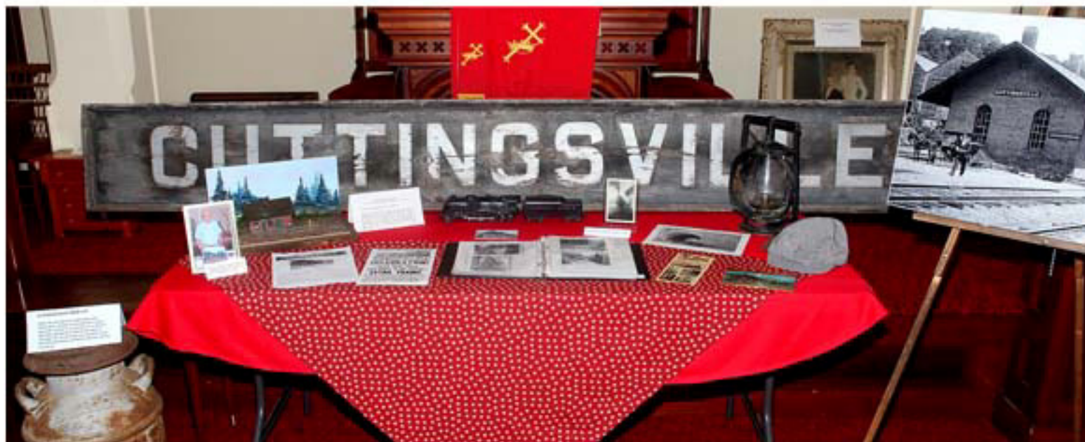
Above exhibit showing Cuttingsville's RR depot sign donated by Gagnon Lumber. The depot was established in the mid 1800s and demolished in the 1950s.