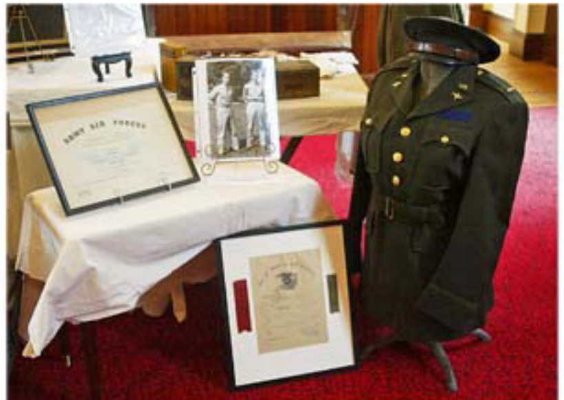
World War II uniform and memorabilia of the Pierce family.