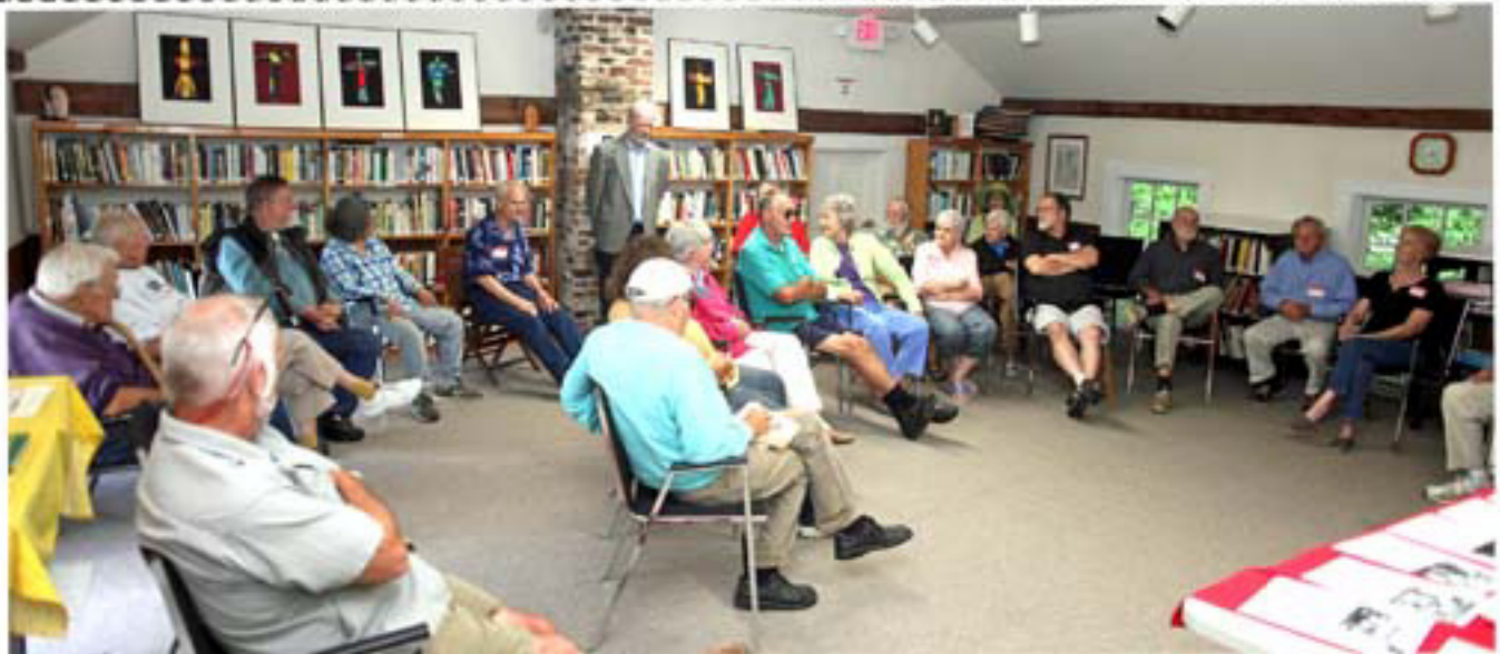
Reunion of Cuttingsville one-room school students held in library August, 2017.

Note from the Co-Editors: It is with great pleasure that our annual Past Times for 2017 is exhibited here in color as a tribute to the many artifacts that have been received from Shrewsbury families through the years. From its formation in 1971, the Shrewsbury Historical Society opened its first museum on the 2 nd floor of the now-library in 1984 for 15 years, thence to the deeded historic church building museum in Cuttingsville which opened in 1999, the SHS has preserved Shrewsbury's history and herein we proudly display just a portion of the collection